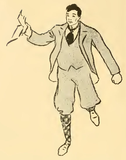
"HAVE YOU A SHAWL-STRAP IN THE HOUSE ?"

that the only safe wheel is the Arena. That's the one I ride. However, at fifty dollars this one isn't extravagant.